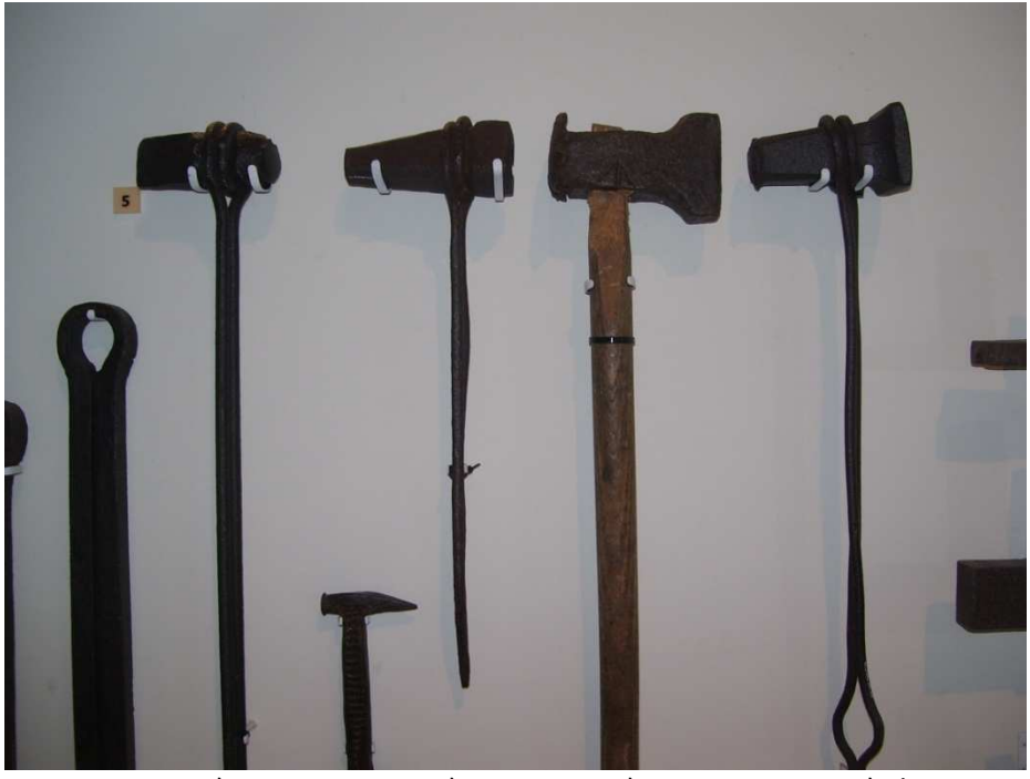
Top row: 1) Hot set. 2) Top Set. 3) Hot set. 4) Flatter.

W.2000.110 Ironworking tools from part of the Oliphant blacksmithing collection, from Oliphant Blacksmiths, East Crosscauseway, Edinburgh, Midlothian.